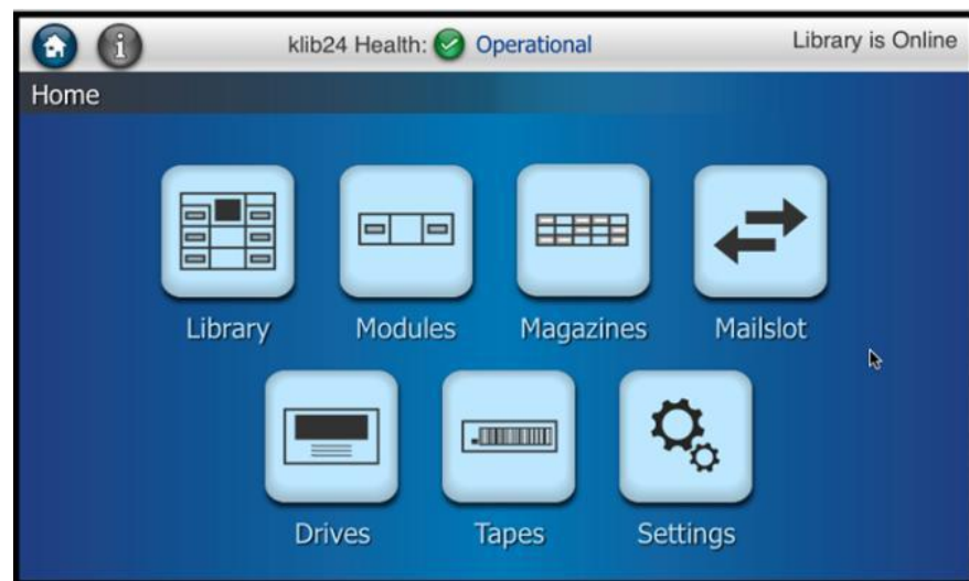
Figure 1. StorageTek SL150 modular tape library touchscreen operator panel

With the StorageTek SL150, simplicity begins with the library installation and continues throughout the life of the product, even as you expand for data growth. The library can be initialized in a few steps via the local touchscreen operator panel, and upgrades are easy because they require no tools, complicated cabling, or technical support.